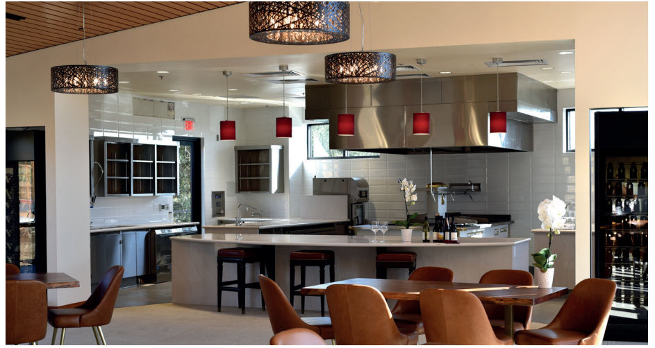
The complete package!

A year later your restaurant is doing so well you are opening two more locations; one in an existing building, the other is new construction. You call East Bay and once again they are able to provide you with the expertise needed to expand efficiently as possible. The existing location is easy, you've already been guided through the process once before, so you work with East Bay to upgrade to some new equipment, and the location is nearly turn-key.