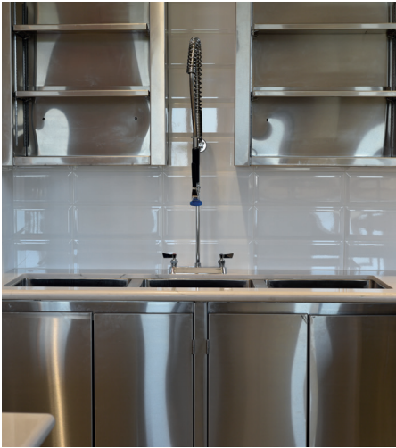
Sleek & seamless

fix the immediate need while setting you up for expansion.