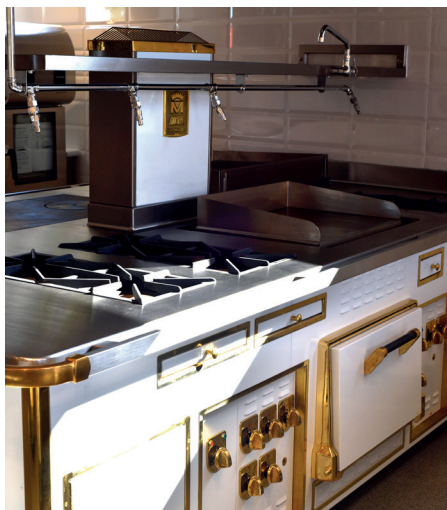
State of the art + style!

Whether you need to set up an entire chain of restaurants with quality kitchen equipment that fits the needs of your business, or you simply want to build your personal "kitchen of the future", East Bay