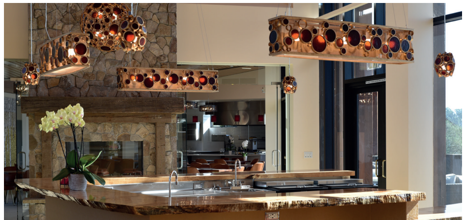
California Winery Project- the perfect blend of form and function.

Koch Logistics partners with East Bay on various projects, learn more about them at: www.eastbayrestaurantsupply.com