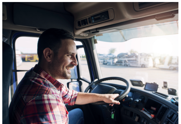
It's a fact: happy drivers are better drivers.

If all the carriers and independent operators can get a snapshot of your facilities and operational ratings in seconds, they can certainly factor that in when bidding on your freight. If you rate poor-